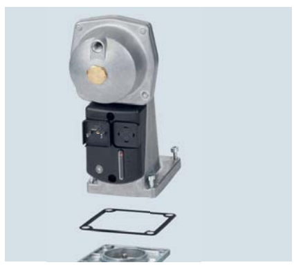
Due to the modular concept SKP actuators can be replaced easily; the valve stays as a closed unit in the gas ramp.