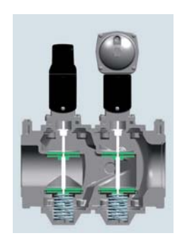
Beispiel: VRD40 bio gas